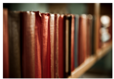
Test everything, hold on to what is good...

Many hours of research are dedicated to prepare each one of our series. We explore the scriptures, the breadth of Christian scholarship, contemporary authors, and consider a wide range of sources outside of our faith.